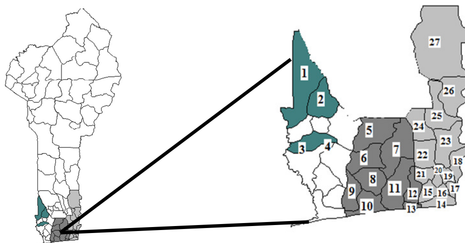
Figure 1. Areas of data collection on porcine cysticercosis in southern Benin