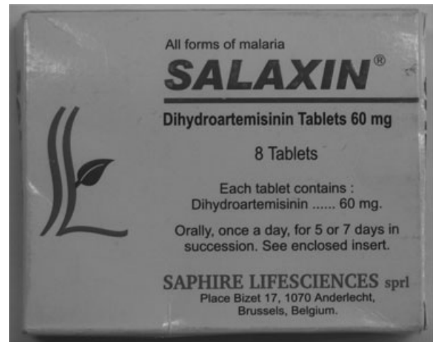
Figure 3 Picture of counterfeit dihydroartemisinin showing fake manufacturing company and address.

Ten of 13 (77%) tablet formulations met the Ph. Eur. requirements, whereas 71% (5/7) of the dry suspension