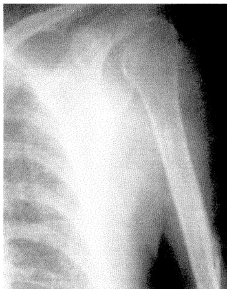
Fig 4—Radiograph of shoulder with lytic lesions.