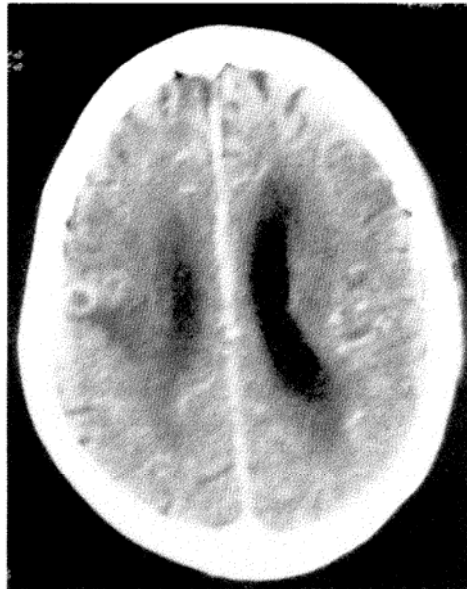
Fig 3—Ring enhancing lesion in CT brain.

The clinical manifestations of miliary TB are non-specific and protean and depend on