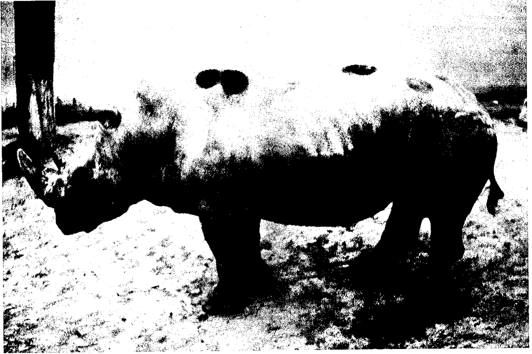
Figure 1. A southern white rhinoceros ( Ceratotherium simum simum ) with cutaneous lesions on its dorsal side associated with combined Malassezia pachydermatis and Candida parapsilosis infection.

Conkey agar, Sabouraud dextrose agar fortified with kanamycin, penicillin, and cycloheximide (incubated at 37°C), and Sabouraud dextrose agar fortified with kanamycin and penicillin (incubated at 25°C). Within 1 wk, massive growth of small white colonies that became cream yellow with age appeared on Sabouraud agar at 37°C. These colonies were identified as M. pachydermatis . Sabouraud agar at 25°C demonstrated rich growth of a Candida sp., identified with conventional methodology as C. parapsilosis . Bacteria were not isolated. Histopathologic examination of a punch biopsy indicated exudative epidermitis.